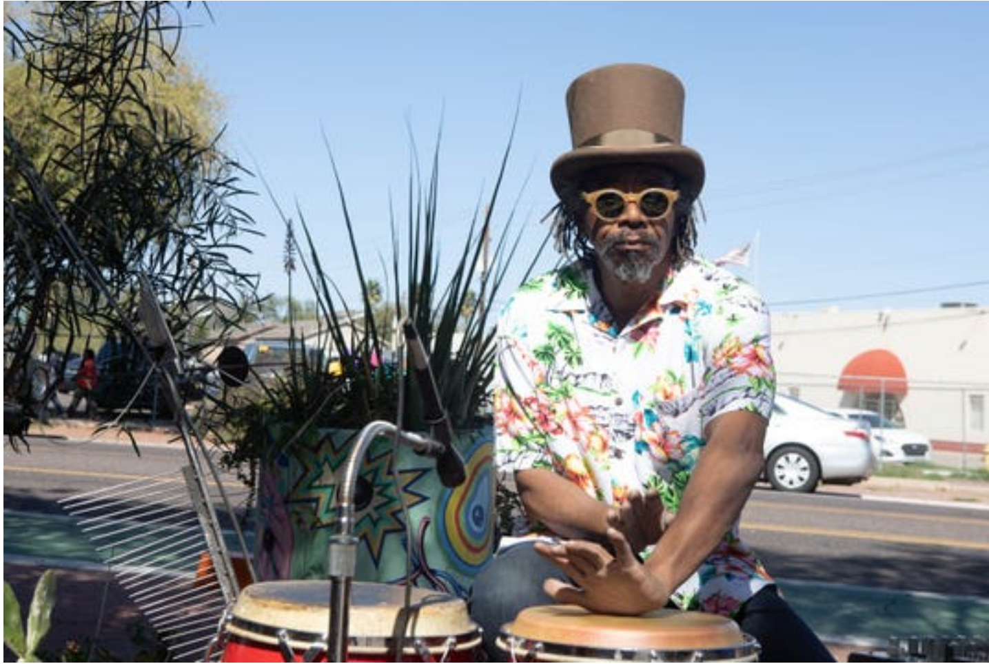
A musician provides percussion on Grand Avenue in Phoenix on March 16, 2019, during Art Detour.

56. Attend a poetry slam. They're hosted regularly by Phoenix Poetry Slam ( https://www.facebook.com/pg/PhoenixPoetrySlam ).