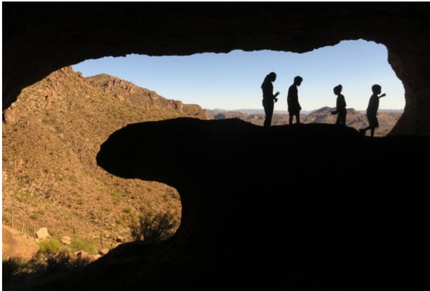
People are silhouetted as they look out onto the Superstition Mountains from inside the Wave Cave in the Superstition Wilderness Area outside of Gold Canyon.

45. For a heart-pumping workout, trek up Piestewa Peak. Summit the 2,608-foot peak by taking Trail 302, a 1.2-mile path that rises 1,200 feet and offers views of the Dreamy Draw recreation area.